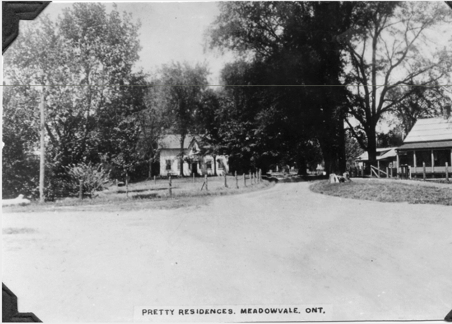
PRETTY RESIDENCES. MEADOWVALE. ONT.