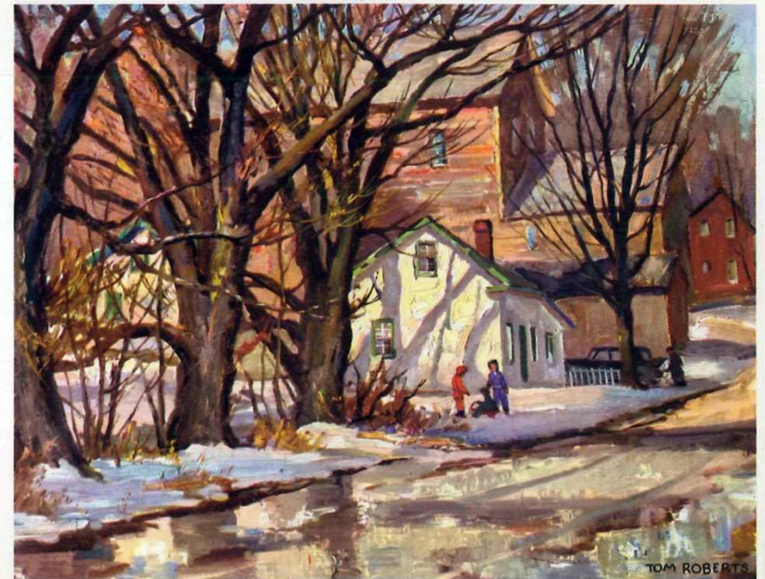
Late Winter - Meadowvale