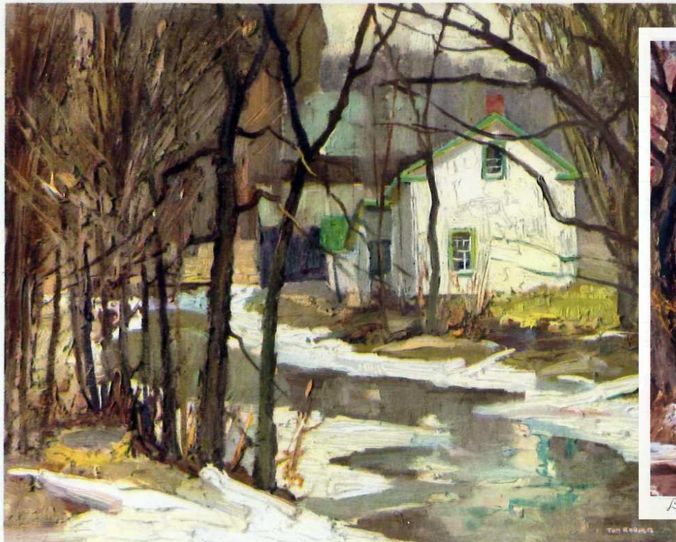
Winter Mill Stream.