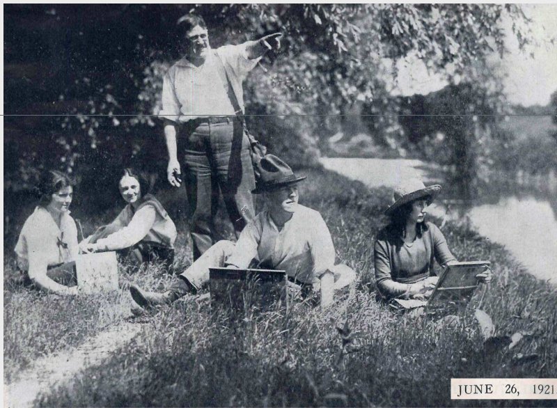
This colony of Toronto artists and students may make Meadowvale their permanent Summer camp.