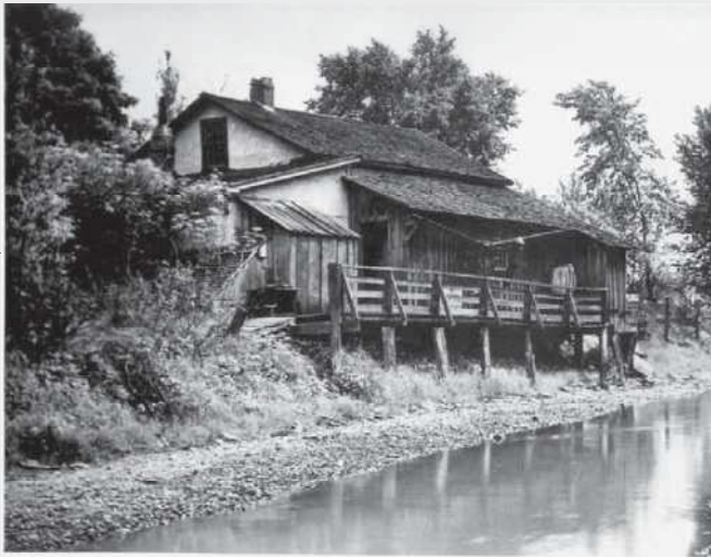
Meadowvale cottage 1911?